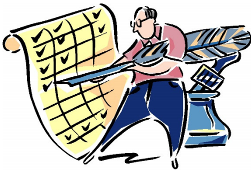
Attendance and Offering Report

Spring Cleaning collection. These products are also not eligible for purchase with SNAP [food stamp] benefits. The requested items include: Laundry Detergent 100oz. or less, Anti Bacterial Wipes, All-Purpose Cleaner, Dish Detergent, Pack of Sponges, Paper Towels, Toilet Bowl Cleaner, and Canvas Shopping Bags. This project will continue through June 5.